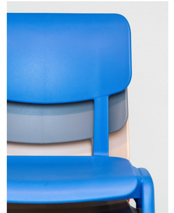
Made from 30% recycled polypropylene