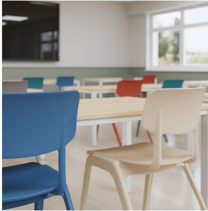
High-impact resistant glass filled polypropylene