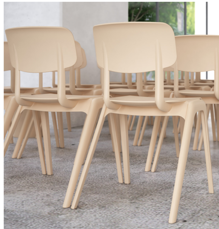
Curved backrest and waterfall seat edge for superior flexibility to maximise comfort