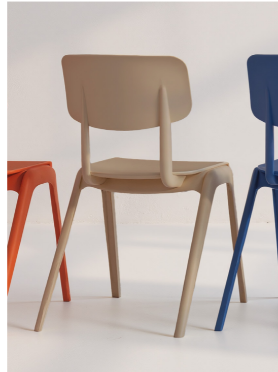
Suitable for occasional outdoor use