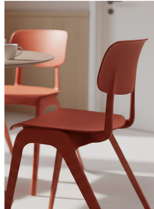
20 year warranty for structural defects