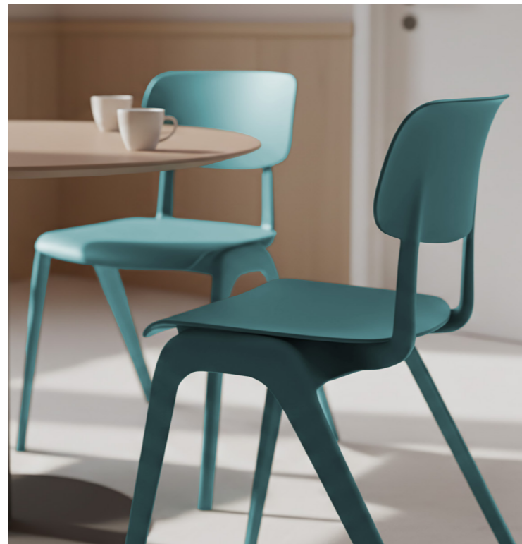
Gas-injection for outstanding strength and longevity