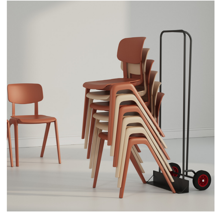
Stacks to 6 on floor and on trolley