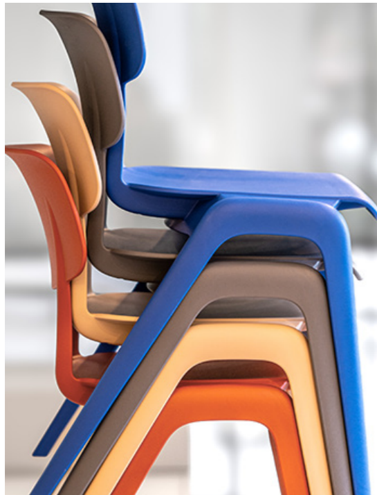
Supports weight of up to 204kg