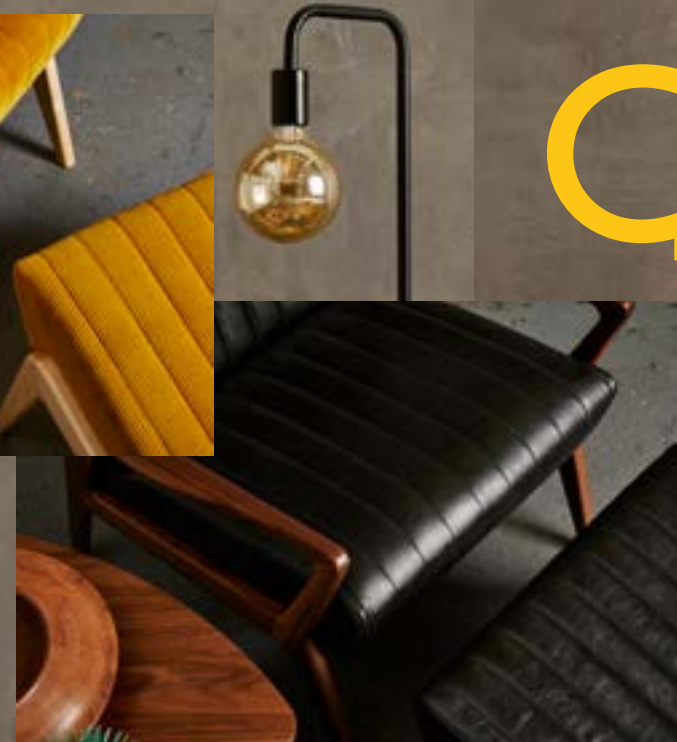
American Black Walnut

To tie the entire collection together, consider adding the Fleet Coffee Table. This matching piece not only complements the design language of the chair and ottoman but also serves as a functional centerpiece for any breakout space. Select from Beech, Ash and American Black Walnut according to your preference. The table's sleek lines and carefully chosen materials make it a perfect addition to the Fleet family, providing a stylish surface for your favourite books, beverages, or décor items.